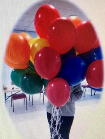
(Top left) Community Champion in Morrison's supermarket Bathgate and (top right) one of our loyal volunteers